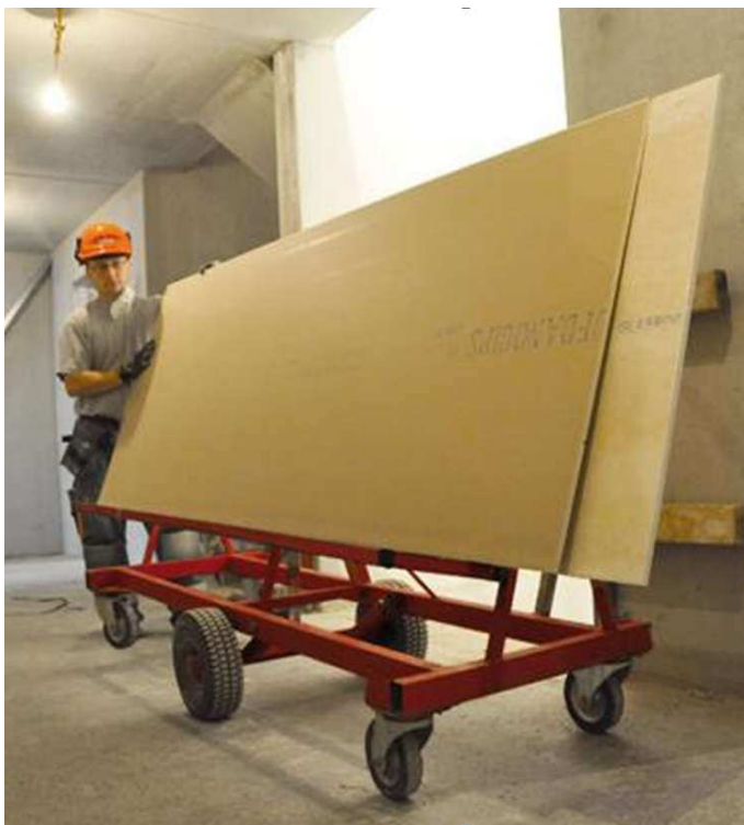
Loaded Trolley Being Moved

The movement of large sheet materials has been a real concern on some sites, with their unwieldy shape and size catching out numerous tradesmen and site operatives, who have suffered unnecessarily due to poor manual handling and double handling. This kind of board trolley eliminates a lot of the double handling, as sheet materials are loaded in a vertical plane and manoeuvred throughout the site. Once in the desired location, the press of a pedal puts the brakes on, and allows the trolley to tilt, converting it into a convenient work bench.