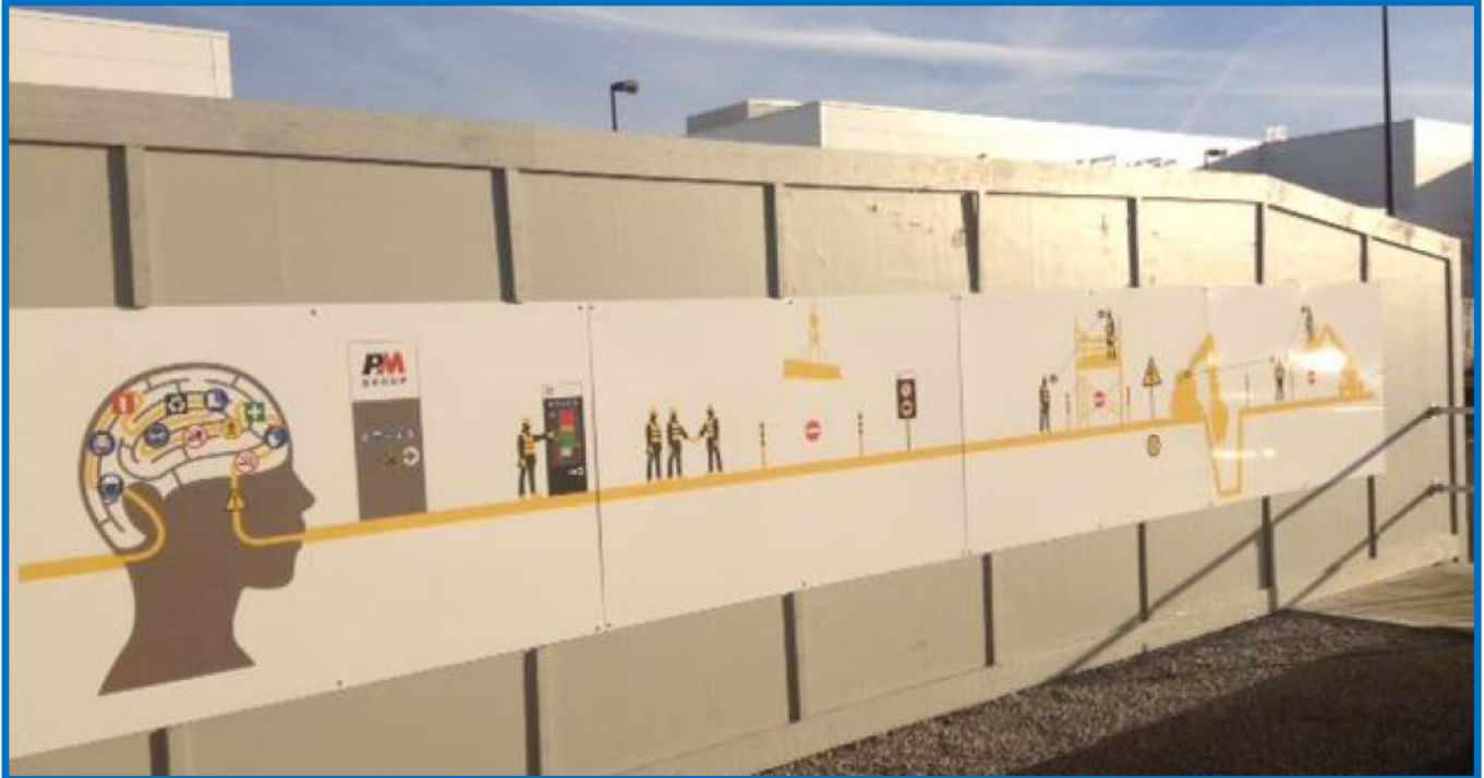
A Typical Safety Line Shown on Site Hoarding

To this end, the safety line was developed as a concept, to graphically illustrate the nature of work taking place, as well as, depicting a positive view of the safe practice and orderly behaviour expected of all personnel on site.